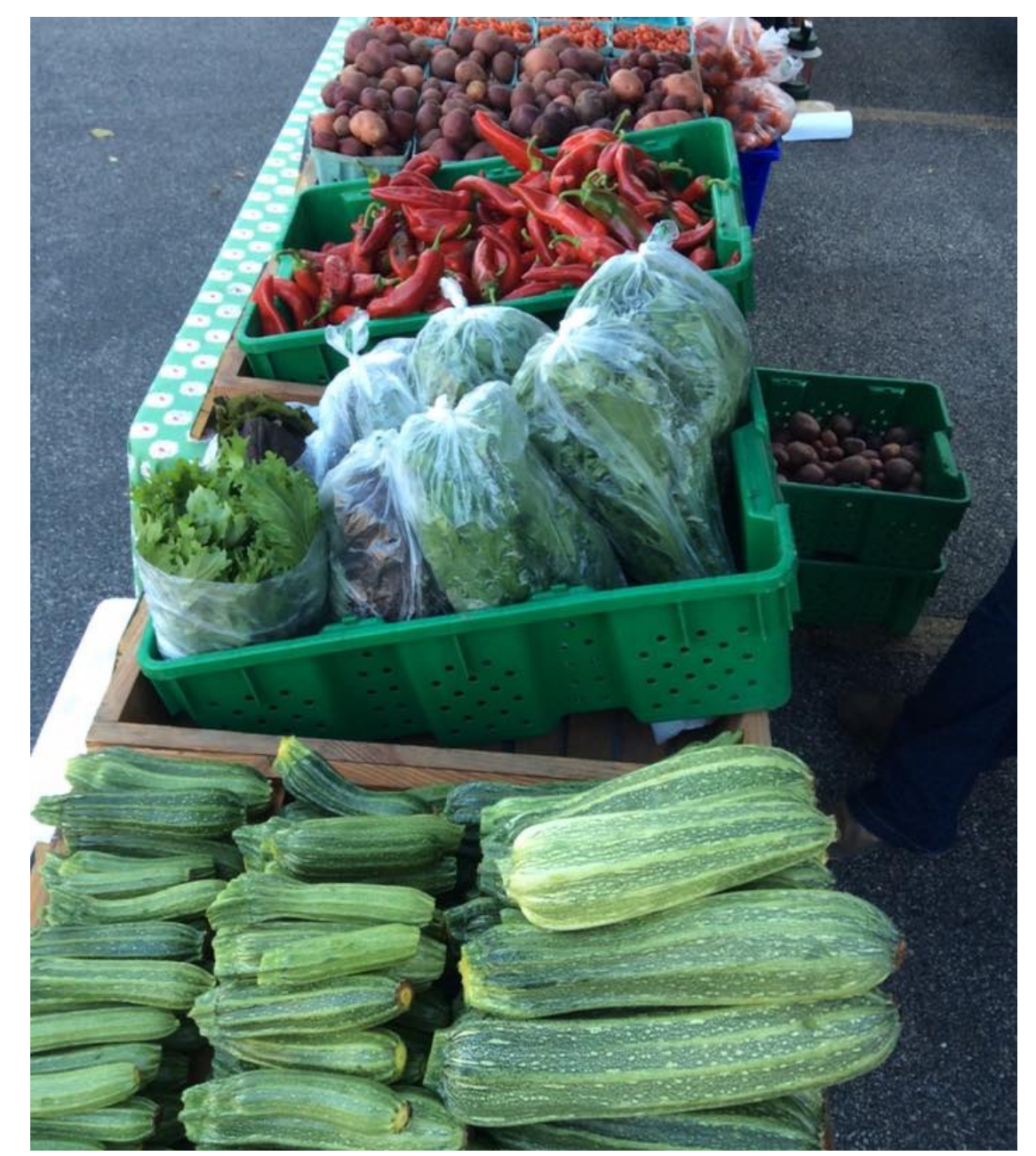
Displayed product – at least 18" above the ground.

Stored product – at least 6" above the ground.